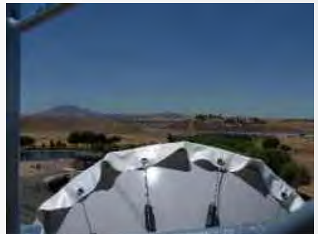
CFIP Full outdoor site