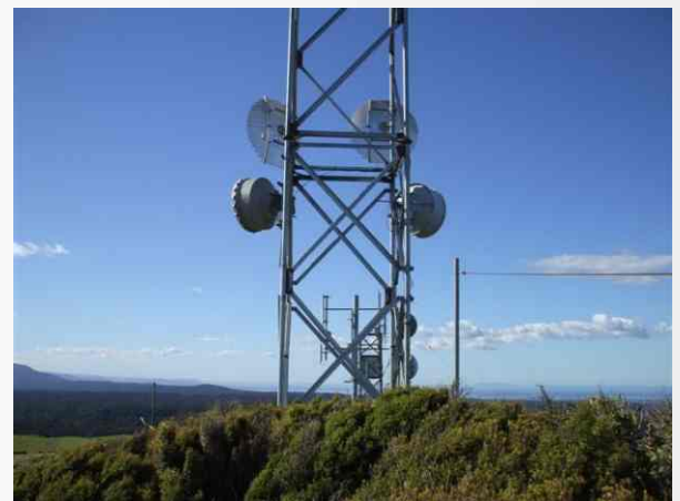
■ CFQ backhaul site (Te Weraiti, New Zealand)